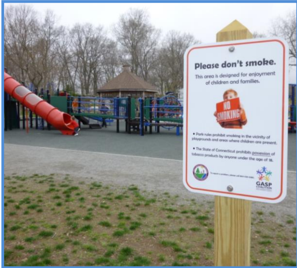
Town of Groton