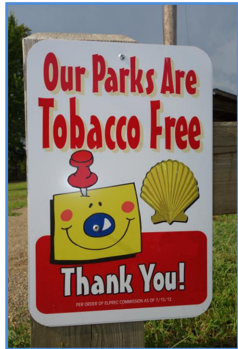
Town of East Lyme