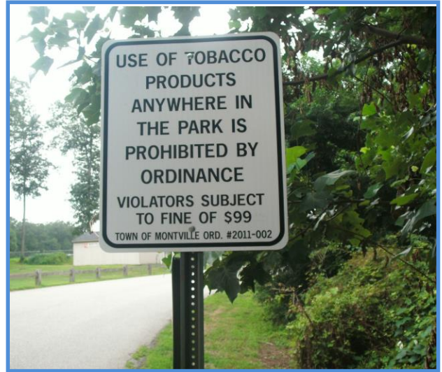
Town of Montville