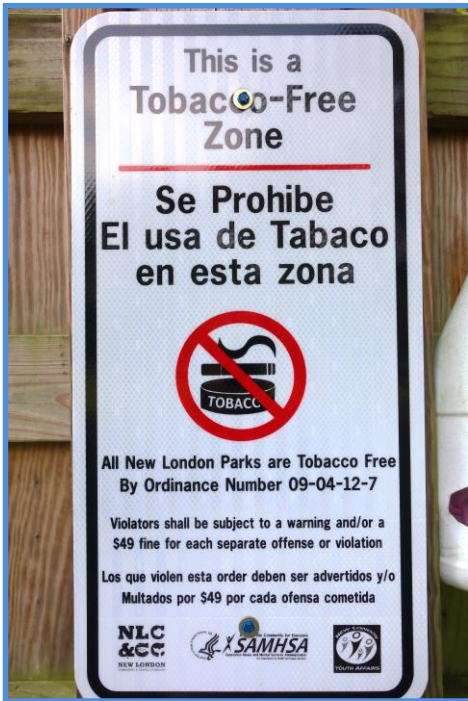
City of New London